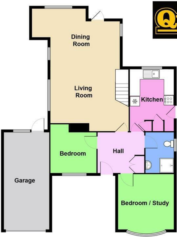
Ground Floor Area: 88.6 m² ... 954 ft²