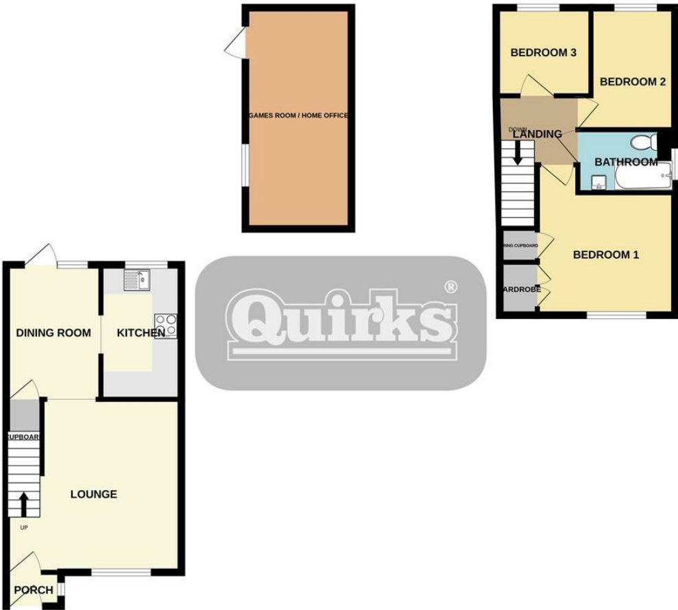
TOTAL FLOOR AREA : 801 sq.ft. (74.4 sq.m.) approx.

This floor plan is for illustrative purposes only. All representations including measurements, doors, windows and fixtures are approximate and NOT TO SCALE. The total floor area includes all floor space associated with the property including garages and outbuildings as depicted. No appliances or services are confirmed as included or tested. Made with Metropix ©2024