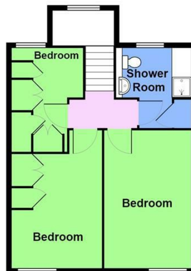
Total Area: 99.6 m 2 ... 1072 ft 2