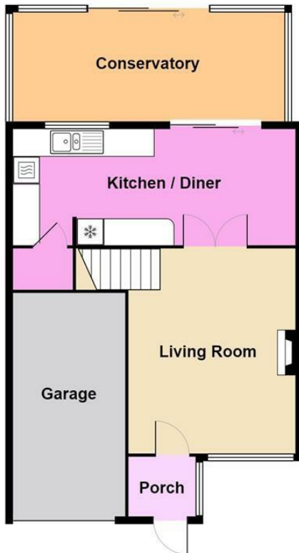
Ground Floor Area: 66.8 m 2 ... 719 ft 2