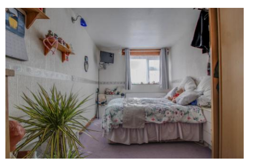
Mill Green Place